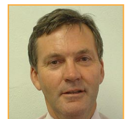
Roger Longland Areas covered: London, Home Counties and Southern England